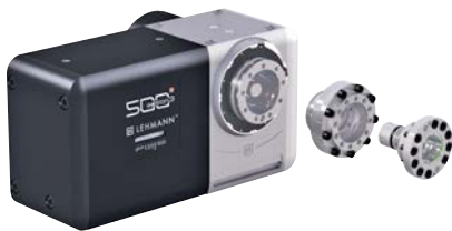
EA-507 with CAPTO retrofit kit