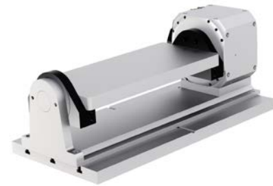
With RFX 600 on Robodrive. Fits perfectly on an L-machine