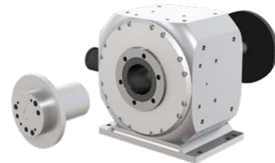
Workpiece clamping with clamping cartridges